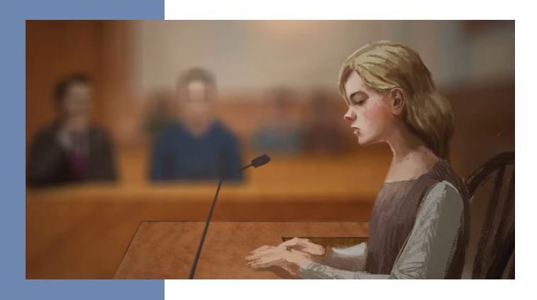
Link to Video Here

An important goal of these video modules and discussion questions is to help and encourage young people to report victimization to adults. However, facilitators should always be cognizant that there are victims who are not able to come forward and it is always possible there are some such victims in your audience. We want to praise victims who were able to report and encourage others to do the same, but we want to avoid putting additional shame and blame on victims who not able to. Reiterate often in these discussions that victims can always choose to report and that victims are never to blame for their own abuse even if they have not yet or are not able to come forward. Do not say that victims should report or imply that those who endure victimization without reporting are not brave or are to blame for allowing others to be victimized